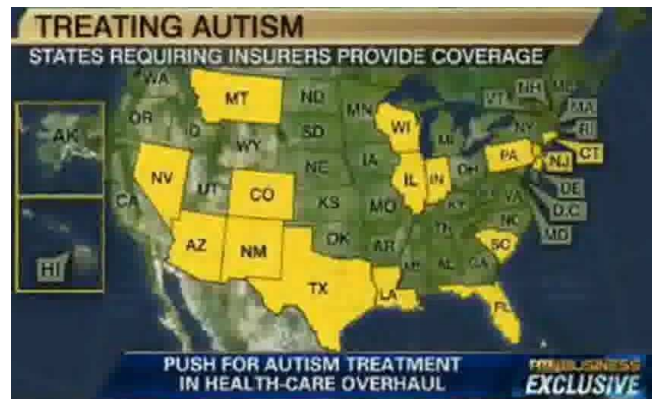
States with Autism insurance coverage: Arizona, Colorado, Connecticut, Florida, Illinois, Indiana, Louisiana, Montana, Nevada, New Jersey, New Mexico, Pennsylvania, South Carolina, Texas, Wisconsin